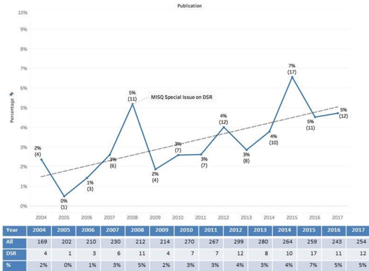
Figure 2. DSR Publications Compared to all Publications Appearing in SSB Journals

We further investigated the DSR papers published in the SSB by analyzing DSR publications by individual journals (Table 6). We report both the total number of publications identified as DSR and DSR work as a percentage of the total publications by journal. We found that DSR scholars correctly perceived JAIS as the most accessible SSB journal. On a yearly basis, between three to 10 percent of JAIS publications were DSR. We were surprised and encouraged to find that MISQ published 31 DSR papers, more than JAIS . The editors of MISQ demonstrated public support of DSR work through a special issue focused on DSR (March & Storey, 2008) and a later editorial (Goes, 2014) that called for more DSR research in IS (p. vi). However, MISQ published a small percentage of DSR papers relative to the total number of papers it published, though the percentage shows evidence of growth. The same holds true for JMIS . The rest of the SSB journals also indicate some growth, albeit small, in the number of published DSR papers. Overall, this finding suggests that, though DSR scholars correctly perceived limited opportunities to publish papers in the SSB, evidence shows that the editorial boards for these journals have demonstrated a willingness to publish DSR papers.